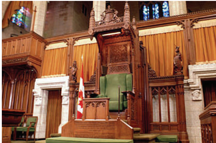
Pictured above is the Speaker's Chair. The Speaker enforces parliamentary rules, and runs Question Period in the House of Commons.