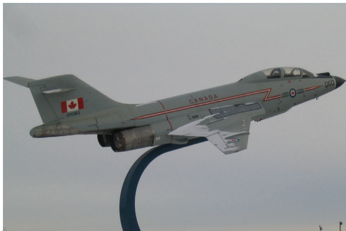
A CF-101 jet at an aircraft museum in Edmonton Alberta. Canada's military equipment may soon all be at museums unless substantial reinvestments are made.